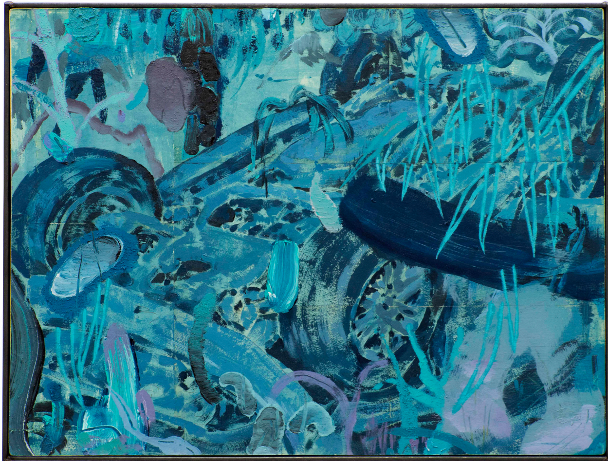
left: Blue Disaster , acrylic and sand on paper, mounted on wooden board, 60x45 cm., 2021