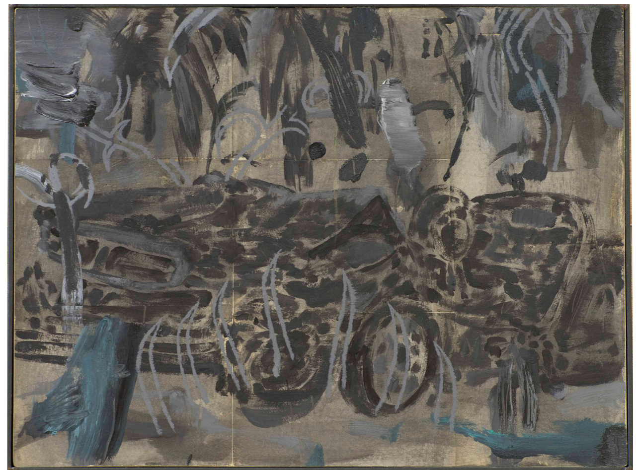
right: Black Disaster , acrylic and sand on paper, mounted on wooden board, 60x45 cm., 2021