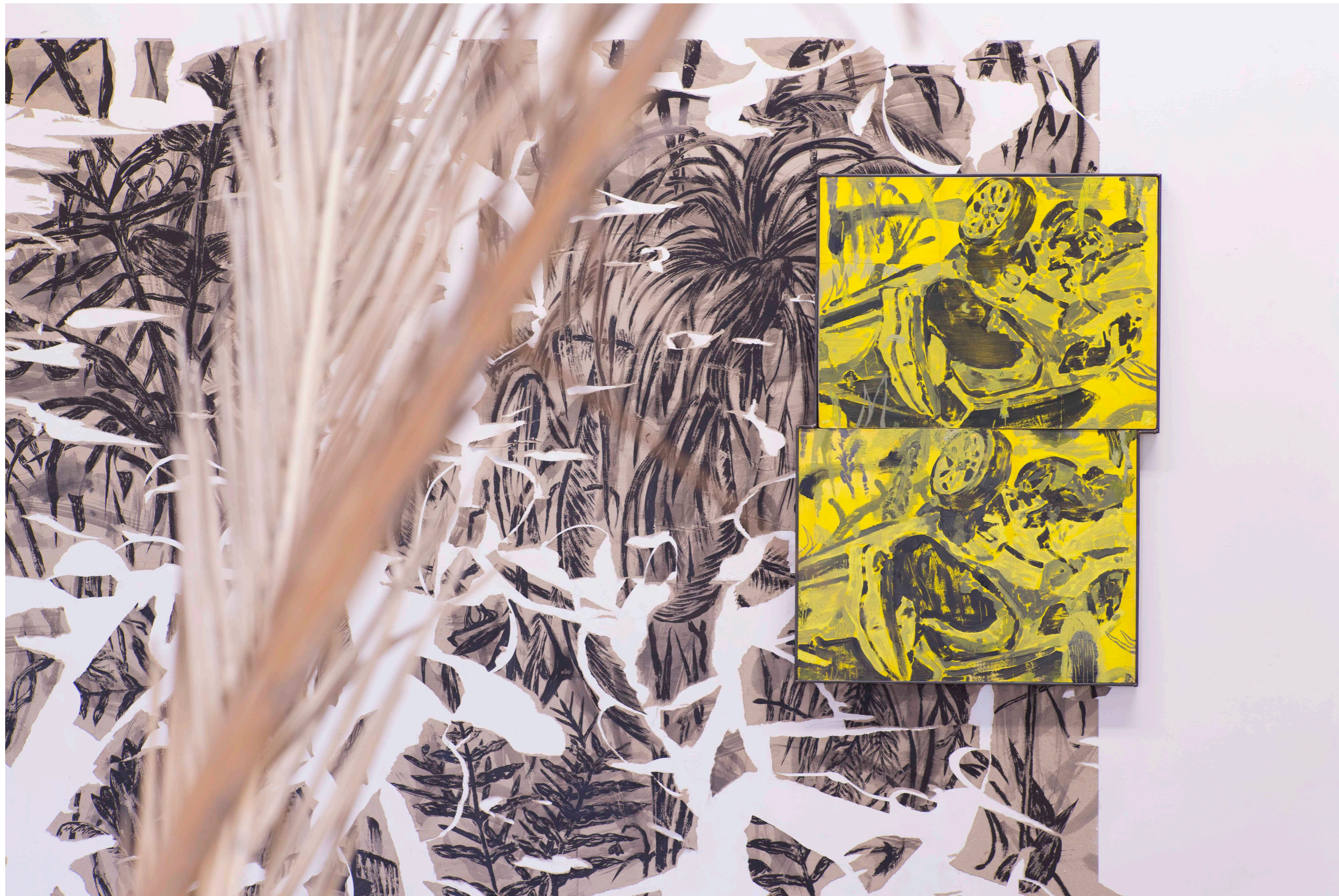
Yellow Disaster (Yellow Disaster Twice) , Acrylic and sand on paper mounted on wooden board, 90x60 cm. (diptych)