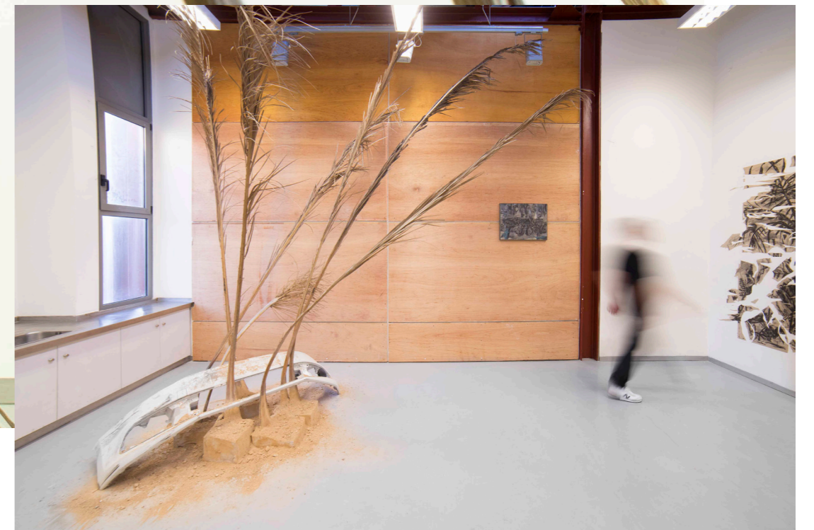
Tomorrow-morrow Land, Installation View, 2021