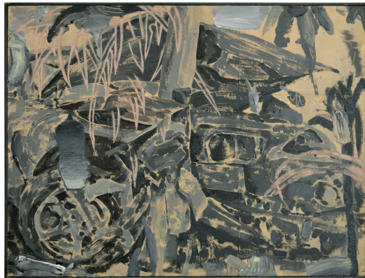
Beige Disaster , Acrylic and sand on paper mounted on wooden board, 60x45 cm., 2021