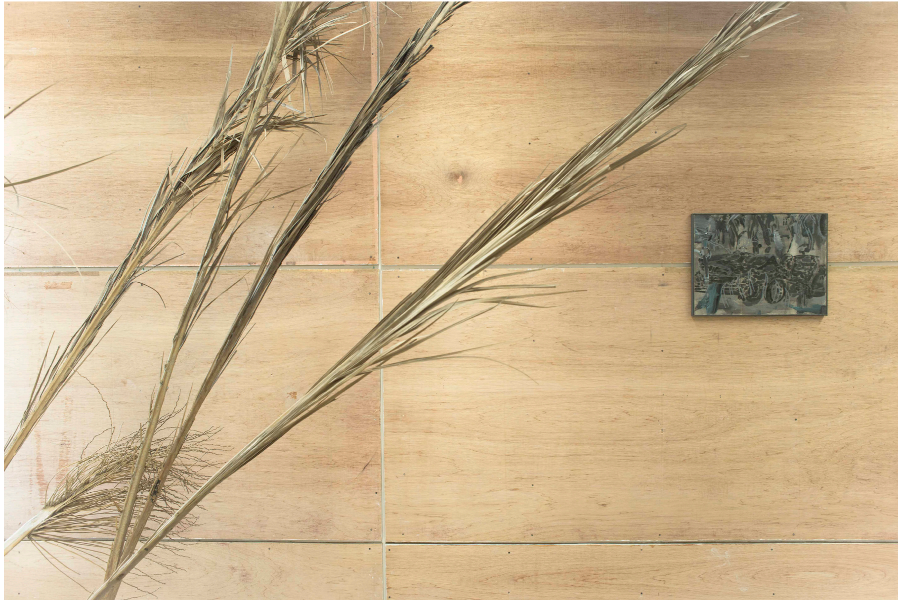
Tomorrow-morrow Land, Installation View, 2021