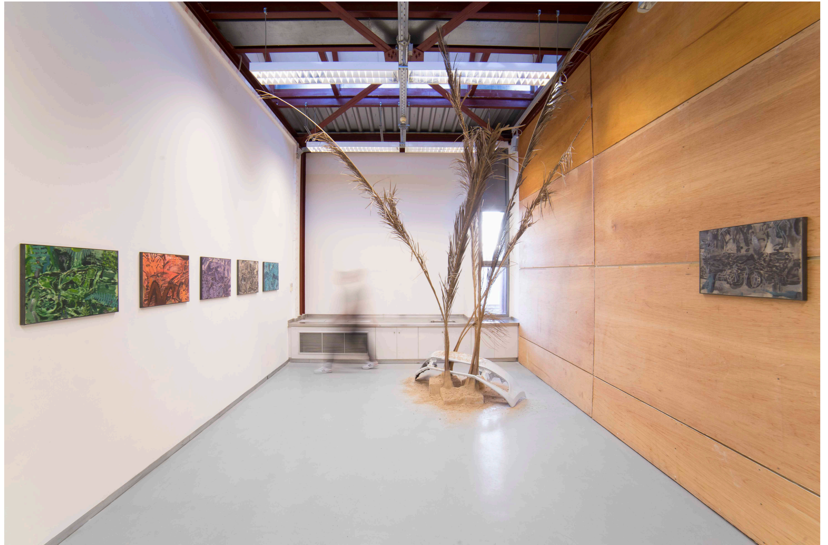
Tomorrow-morrow Land, Installation View, 2021