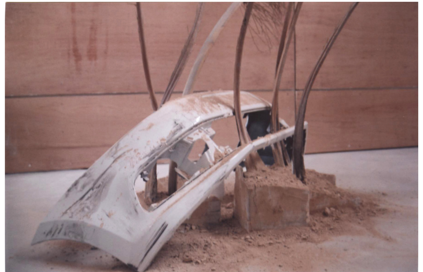
Installation views of "Tomorrow-morrow Land", Analog Photography