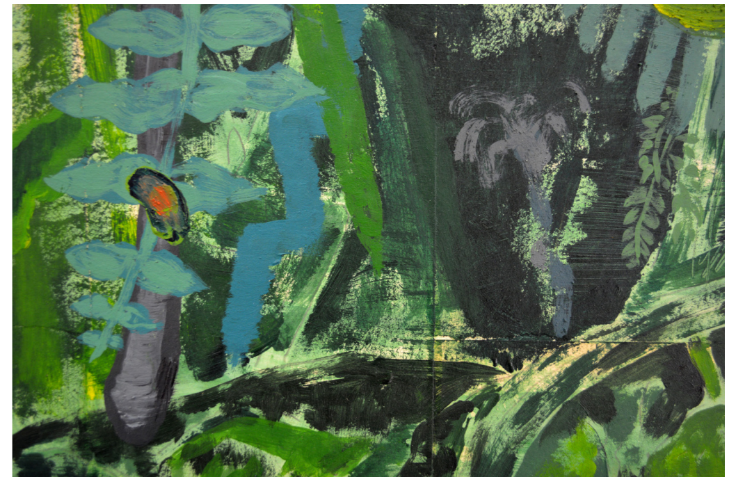
Green Disaster , Acrylic and sand on paper mounted on wooden board, 60x45 cm., 2021