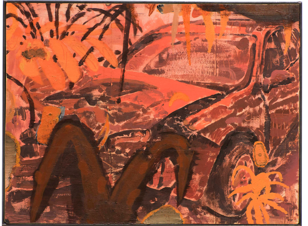
Red Disaster , Acrylic and sand on paper mounted on wooden board, 60x45 cm., 2021